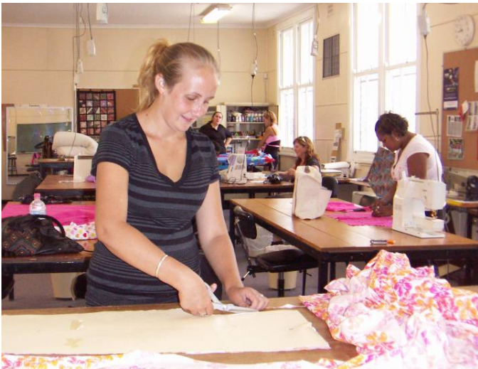
Young mothers attending TAFE Clothing Production Certificate 1