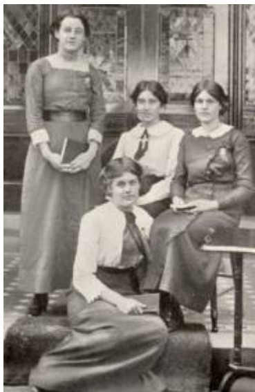
Above Left: Mary's Mount College Councillors 1913